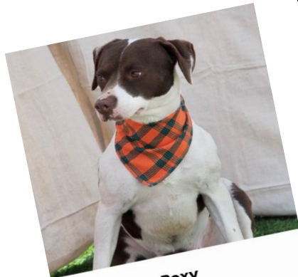
Roxy Pointer mix

Thank you for helping Gracie's Friends!!!